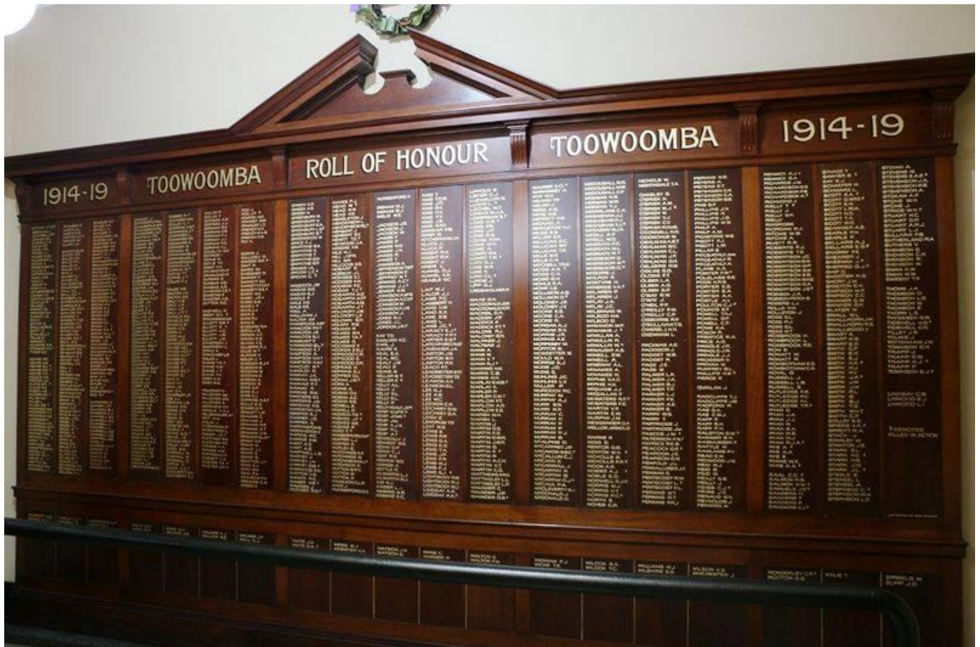
Toowoomba Soldiers' Memorial Roll of Honour